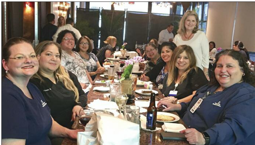
Alamo City chapter members gathered for an educational program at Paesanos restaurant.

insight into the many ways we can assist our patients with phosphorus control.