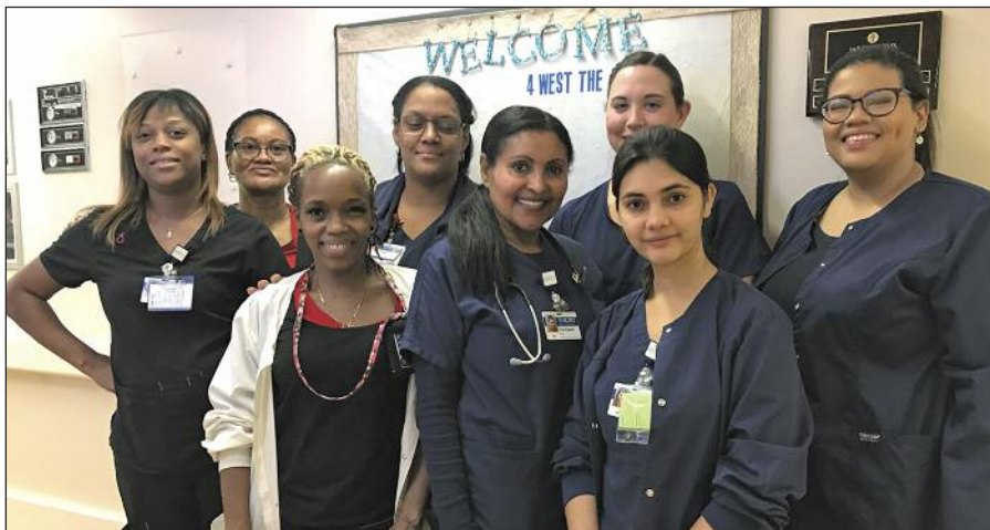
Emory Saint Joseph Hospital in Atlanta is in the region covered by the Dogwood Chapter. Pictured are Emory St Joseph's nephrology nursing staff 4 West.