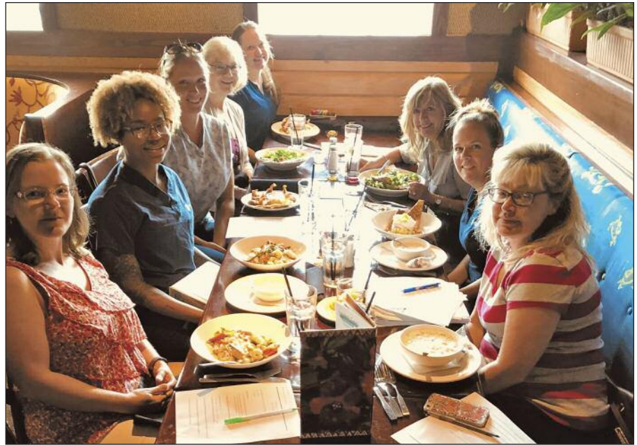
The First State chapter officers held a planning meeting in July.

Please contact a chapter officer with any questions or comments.