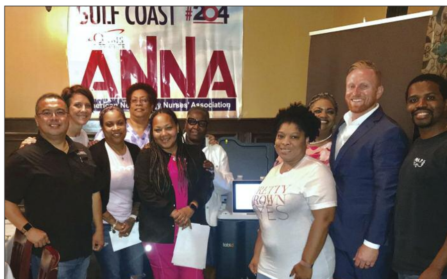
The Gulf Coast Chapter recently held a product presentation on the Tablo dialysis machine.