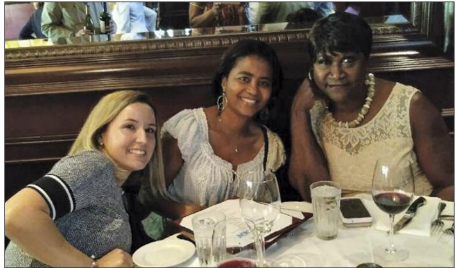
South Florida Flamingo chapter members enjoyed an educational dinner at Abe & Louie's Steakhouse in Boca Raton, FL